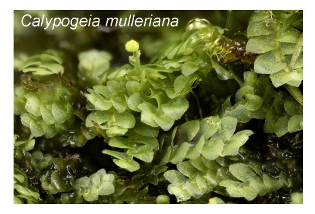
H. Leafy Liverworts with Toothed Leaves and Succubous Insertion. A better analogy for leaf insertion might be roof shingles.

With a succubous insertion the rain will not run in. Plagiochila porelloides is a large liverwort, somewhat suggestive of a wrinkled Plagiomnium moss, that is fairly common on vertical rock surfaces, especially near streams. The photo below was taken at Sheick Hollow State Nature Preserve in Hocking County.