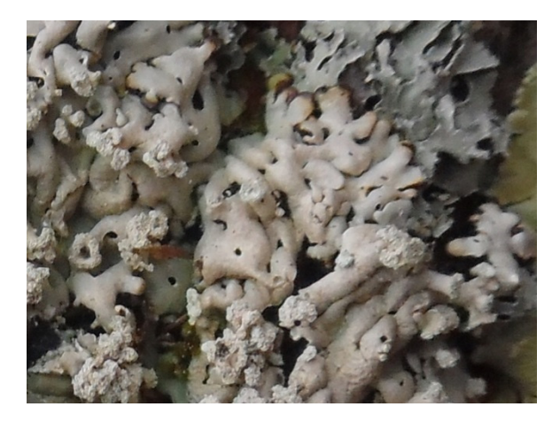
Closeup of M. terebrata showing holes in the hollow thallus. Photo by Tomás Curtis.

Menegazzia terebrata. Photo by Tomás Curtis.