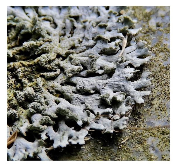
Physcia dubia on a cemetery stone in Portage Co., Ohio, 7/22/17.

Physcia , or Rosette Lichens, is a genus of small foliose lichens in the family Physciaceae. Some species, such as Physcia millegrana , are extremely common and pollution tolerant, but others are quite rare. Rosette lichens can be found on tree bark, twigs, or rocks in full sun to light shade.