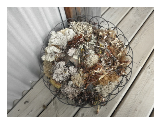
Basket of Arctic lichens as a decoration on the deck of a visitor's center.

Last summer my wife and I did a tour of the Yukon Territory of Canada. Much of the northern part is Arctic tundra and soil lichens are everywhere. They are the primary winter food of caribou and they also play a part in peoples' lives, as evidenced by the included photos.