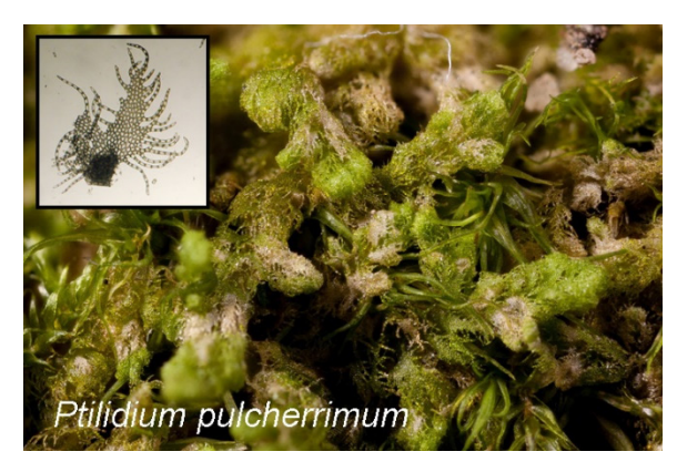
Other Ohio genera of leafy liverworts with feathery leaves include Blepharostoma and Trichocolea .

D. Leafy Liverworts with Finely Dissected (feathery) Leaves. Unlike mosses, which have leaves that are always simple and often are entire-margined, liverwort leaves are often very elaborate. Some have leaves that are ciliate (inset on photo), for example Ptilidium pulcherrimum . This is a robust species that forms flat mats on logs. The one shown below was photographed at Cuyahoga Valley National Park in Summit County.