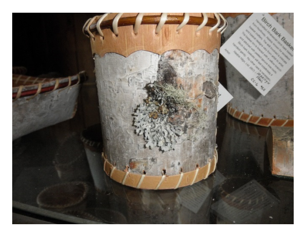
Lichens used to decorate a birch bark basket.