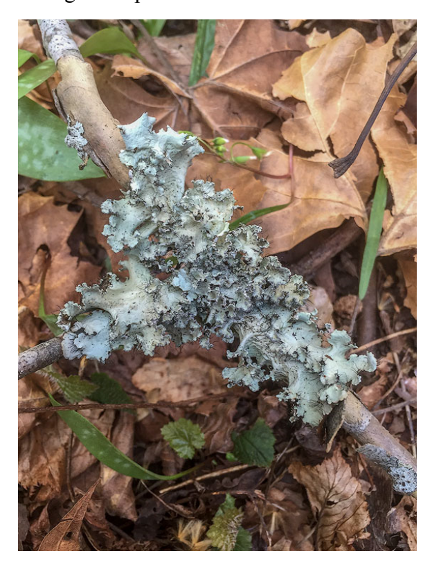
Ruffle lichens taken with a smartphone.

close-up photo of a lichen thallus with plenty of detail for identification purposes. Some smartphone cameras, including the iPhone 7 Plus, have a dual lens that features a 2X telephoto which serves as a 2X macro lens for close-ups. Position the smartphone so that the lens is at a 90-degree angle to the main surface of the lichen thallus, to maximize depth-of-field. Hold the smartphone firmly with both hands, and if possible lean against a tree or rock to minimize any movement of the phone during the exposure.