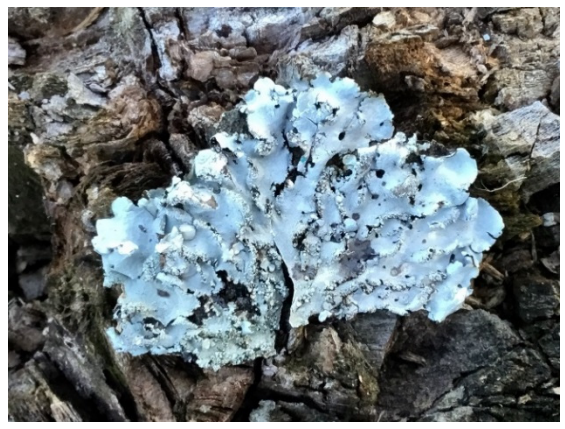
Hypotrachyna afrorevoluta, Portage Co., Ohio, 6/29/17