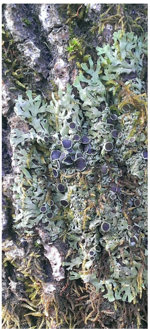
Lea's bog lichen with moss on ash tree in Smokey Hollow, a new location for an extremely rare lichen. Unlike other Phaeophyscias, Lea's bog lichen is white on the undersurface instead of black.