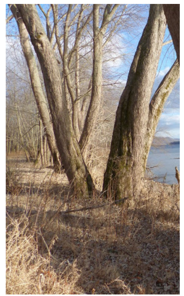
Ohio River bottomland habitat for Lea's lichen.

of the few to survive under water for days, maybe weeks, they are definitely susceptible to un-natural chemicals added to our waterways. Unfortunately, the majority of trees we found Lea's bog lichen on were ash trees. In our area, the Emerald Ash Borer is probably going to kill most of the ash trees in these flood plains. In fact, many of them we saw were stressed already because of this beetle. No doubt in 5 years most of these ash trees will be gone, along with the lichens growing on them. Because of these threats, and the fact that its habitat is so restricted, there has been talk of listing this species as a federally endangered species.