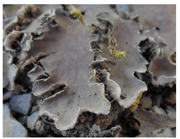
Peltigera rufescens, Summit Co., Ohio, 5/13/17.

The heavily tomentose lobe margins, brittle thallus, and tufted rhizines of Peltigera rufescens are diagnostic. While most pelt lichens grow in moist and shady situations, the field pelt lichen typically grows in dry habitats and under direct sunlight. It is described in textbooks as being "fairly common throughout its range on the soil of lawns, fields, sunny banks, and barrens."