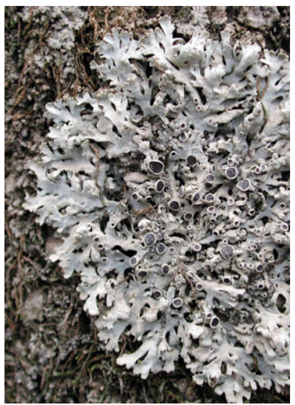
Lea's bog lichen, Phaeophyscia leana . Grey in color when dry, green when wet. This lichen has narrow, strap-shaped lobes and usually has apothecia.

In the 1830's, a man named Thomas Lea collected a river bottomland lichen in a "bog" near Cincinnati, Ohio. This lichen was named Phaeophyscia leana after the first collector, and few people have seen this lichen since its first discovery. This lichen grows in a particular habitat, one not known for lichen diversity. It grows in floodplains of large rivers, specifically where the spring waters rise and stay for days on end. Most lichens cannot live in this habitat due to the amount of time under water, but this is exactly where Phaeophyscia leana , commonly known as Lea's bog lichen, is found.