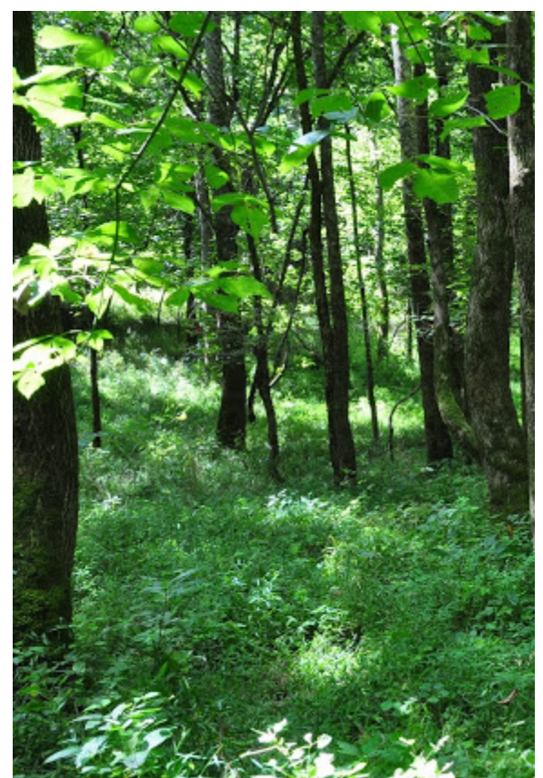
Lea's bog lichen habitat in The Edge of Appalachia Preserve. This area along Ohio Brush Creek near the Ohio River holds 6 feet of water during floods.

It has been a few years since I have found this lichen in a new spot on the preserve, so this year I was excited to hear about a new property the preserve was buying near the Ohio River. A new addition to the preserve called Smokey Hollow is protecting almost 1000 acres of new land. I visited this tract with Rich McCarty specifically to find Lea's bog lichen because the habitat looked perfect. After a short time of searching, we came across a patch of ash trees that contained numerous rosettes of this state endangered lichen. I saw at least 45 trees wearing this lichen, primarily Fraxinus sp. (ash), Acer negundo (box elder) and some Acer saccharinum (silver maple).