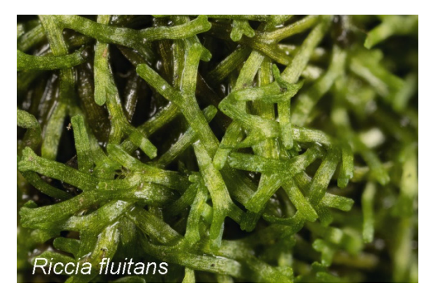
Ricciocarpos natans forms rosettes that float on calm water, often alongside Riccia fluitans and other aquatic vascular plants,

B. Complex Thalloid Liverworts with Buried Capsules. Complex thalloid liverworts are somewhat spongey, with air chambers in the tissue. In a few principally aquatic species the sex organs, rather than being borne on raised or otherwise evident structures, are buried in some of the air chambers. One of these, Riccia fluitans , grows in interwoven tangles of narrow ribbons floating just beneath the surface of a pond or stranded on mud nearby. This species is a favorite aquarium plant; in the trade it is known as "crystalwort." The photo below was taken in a shallow pond edge at Calamus Swamp in Pickaway County.