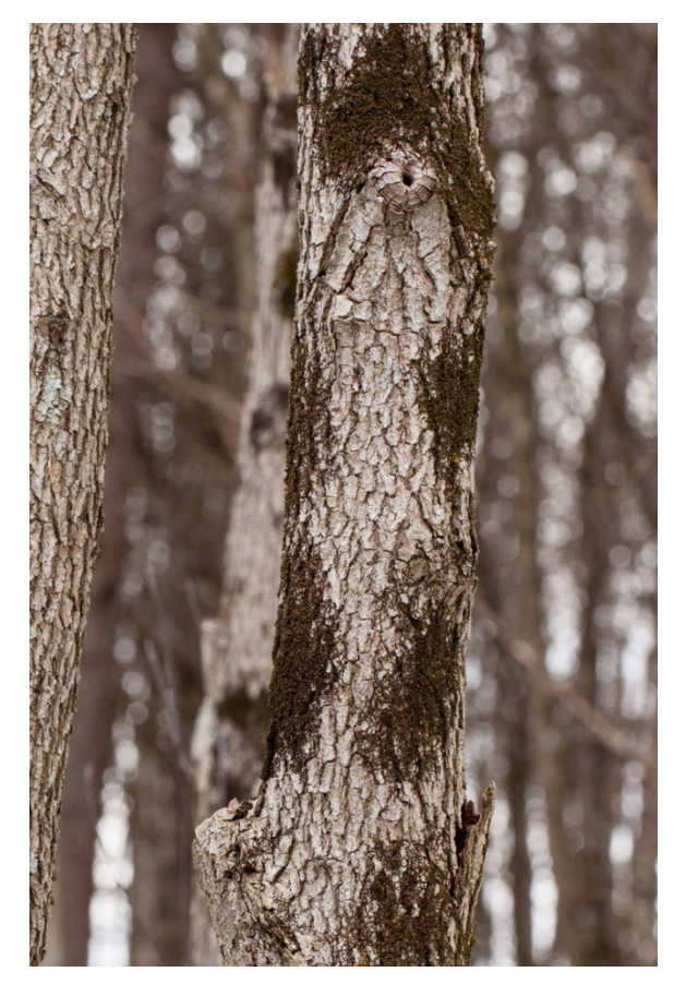
So common that it has been called Frullania e-boring-censis , this species grows in dark circular patches of wiry stems, tightly adherent, almost lichen-like in aspect. The picture below was snapped in Rothenbuhler

Because it is very common, growing at eyelevel on trees throughout the region, Frullania eboracensis has probably been seen by every nature-lover, although perhaps without being recognized as a liverwort.