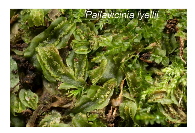
Pellia epiphylla is a large, relatively common simple thalloid liverwort found on bare soil such as road cuts, drainage ditches and streambanks in wooded areas. The individual shown below was seen adjacent

C. Simple Thalloid Liverworts . These plants are in most instances ribbon-like, and usually just a few cells thick, smaller and more delicate than their complex cousins. Pallavicinia lyellii is often found in swampy environments on peaty soil. The specimen shown below was found on a well-rotted stump in a vernal pool depression at Garbry Big Woods Sanctuary in Miami County.