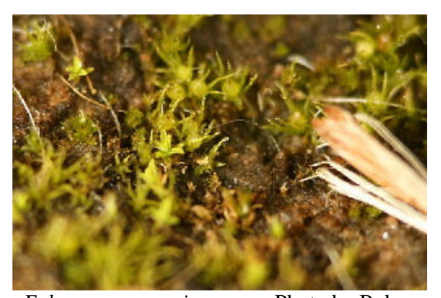
Ephemerum crassinerveum

A final example, among the tiniest of the tiny, is the aptly named genus Ephemerum (family Ephemeraceae), of which E. crassinervium is our most common species. It occurs, spring or fall, as scattered plants amidst a thin but sprawling alga-like growth stage called the protonema, and is known from only 8 counties in the State.