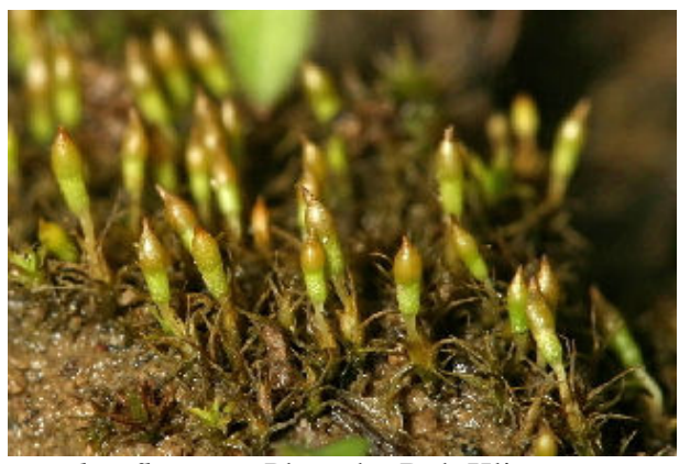
Bruchia flexuosa

Many ephemeral mosses have sporophytes with setae that are moderately or very short. Bruchia flexuosa , (family Bruchiaceae) is an elegant spring-fruiting species known from 9 counties. The capsules, which are elevated slightly above the linear leaves, have a broadly tapered neck that contributes to an unusual overall shape reminiscent of a weather balloon. Like many ephemerals, Bruchia capsules lack the lid-like operculum that most mosses have, and thus the capsule ruptures irregularly to release the spores.