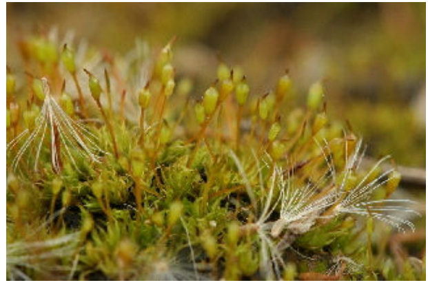
Pottia truncata

Interestingly, there is another plant, smaller but otherwise nearly identical in appearance that occurs in the same habitats (fallow fields, roadside ditches, etc.) as does Physcomitrium but it most often fruits in fall, and is only rarely seen in spring. This is Tortula (formerly Pottia ) truncata (family Pottiaceae). While the Ohio Moss Atlas shows only five county records for this species, it is probably much more common, at least in regions with calcareous soils. The apparent rareness is probably an illusion due not to actual scarcity, but rather because naturalists don't tend to crawl around on the ground as much in November as they do in May.