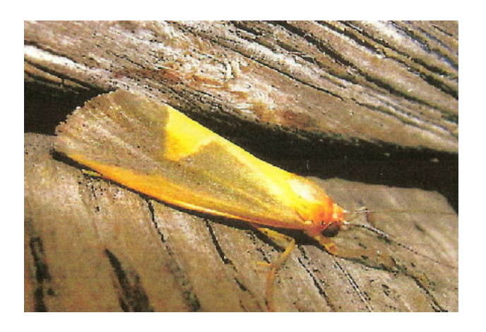
Cisthese plumbea, Lead-colored Lichen Moth.