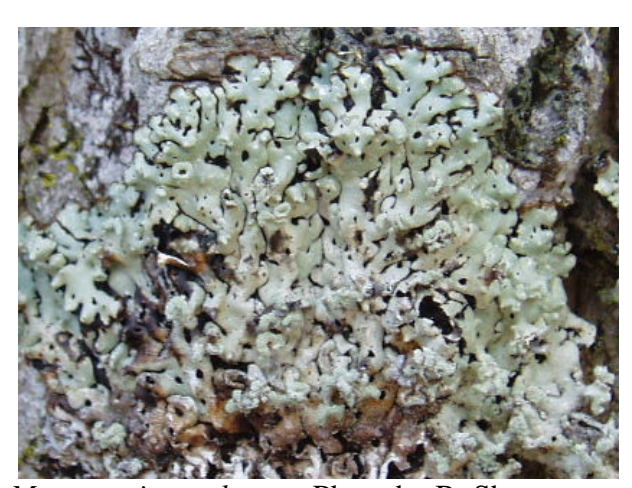
Menegazzia terebrata