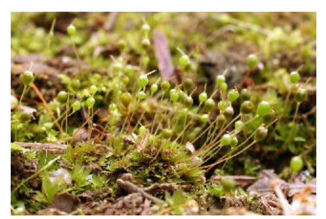
Physcomitrium pyriforme, Photo by B. Klips

For many species, their timing of occurrence is either during spring or fall, but not both seasons. One of the most commonly observed species, somewhat larger than the other plants mentioned in this article, is the "urn moss," Physcomitrium pyriforme (family Funariaceae). It is a spring ephemeral with distinctive broad leaves clustered at the base of the plant, and abundantly produced sporophytes each with a long seta (stalk) bearing a capsule shaped like a child's toy top. P. pyriforme is known from 51 of Ohio's 88 counties.