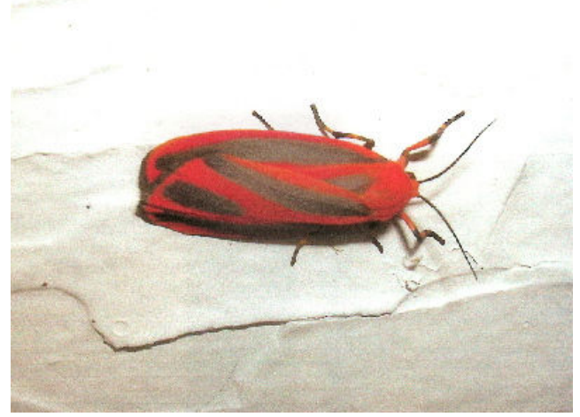
Hypoprepla miniata, Scarlet-winged Lichen Moth.

Members of the subfamily Lithosiinae in the family Arctiidae (tiger moths) are commonly known as lichen moths. W. J. Holland (The Moth Book, 1905) discusses and illustrates 18-20 species. C. V. Covell (A Field Guide to the Moths, 1984) has about the same number for the eastern United States. The lichen moths are fairly small, with a wingspan usually less that an inch across. The larvae feed mostly on lichens; the adults are often attracted to light.