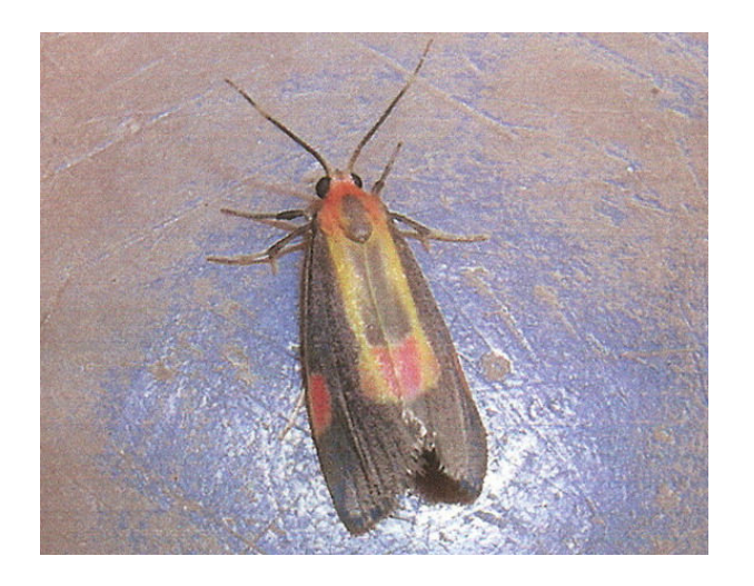
Cisthese packardii Packard Lichen Moth.