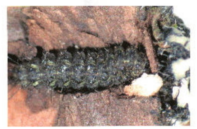
Lichen moth larvae.