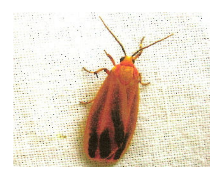
Hypoprepla fucosa, Painted Lichen Moth.