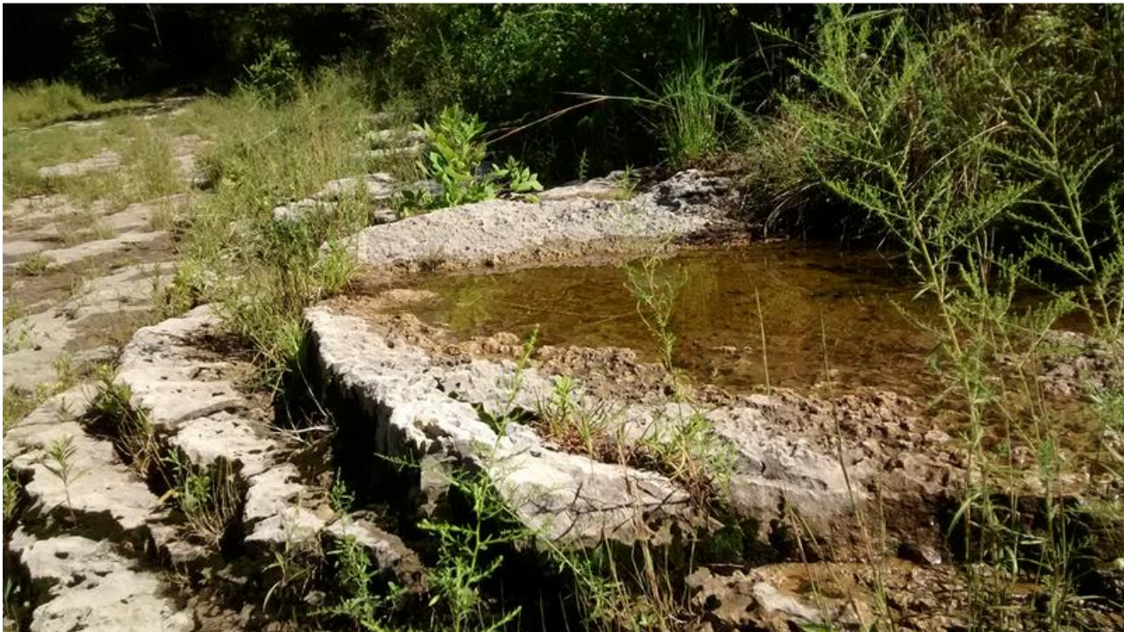
Along the river at Stillwater Priarie.

As an alternative, a few people may wish to visit one of two smaller sites.